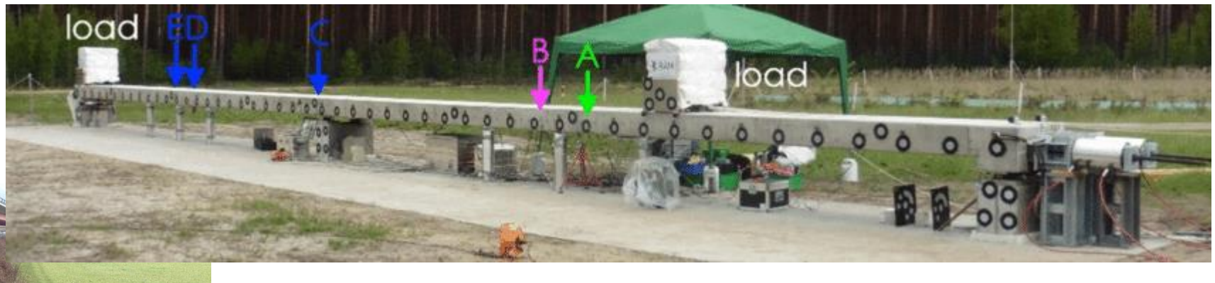
Reference structure, Germany