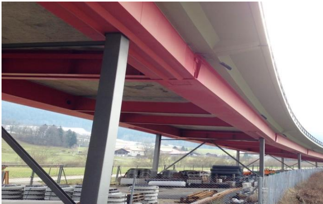
Viaduc Crêt de l'Anneau, Switzerland

The beneficiaires have been asked to list a few shared objects and then, the ESRs were invited to discuss and choose an object to be shared with one or several other ESRs. This leads to common posters that have been presented during events, joint publications. During the training weeks, we also dedicated time slots to teamwork (half-days).