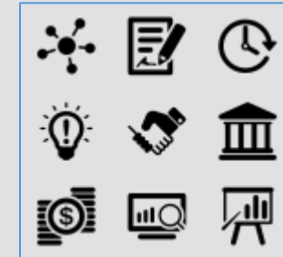
MCAA Contractors Support and management