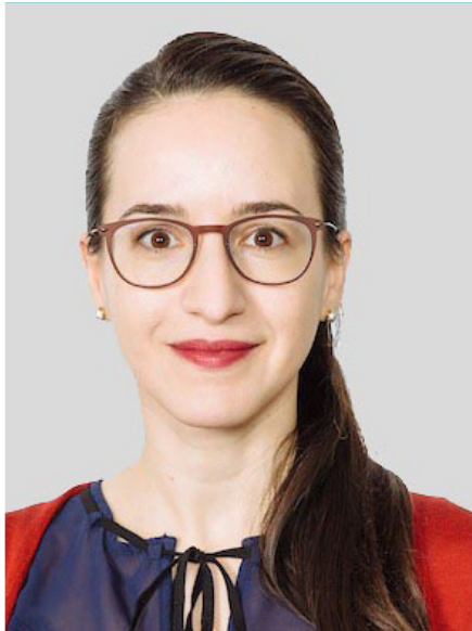
Lecturer in Interaction Design University of Limerick, Ireland