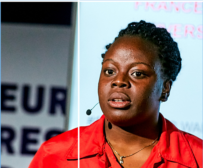
Marie Skłodowska-Curie Fellow University of Bologna